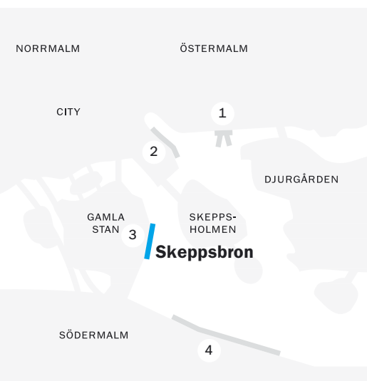
1. Strandvägen 2. Nybrokajen 3. Skeppsbron 4. Stadsgården