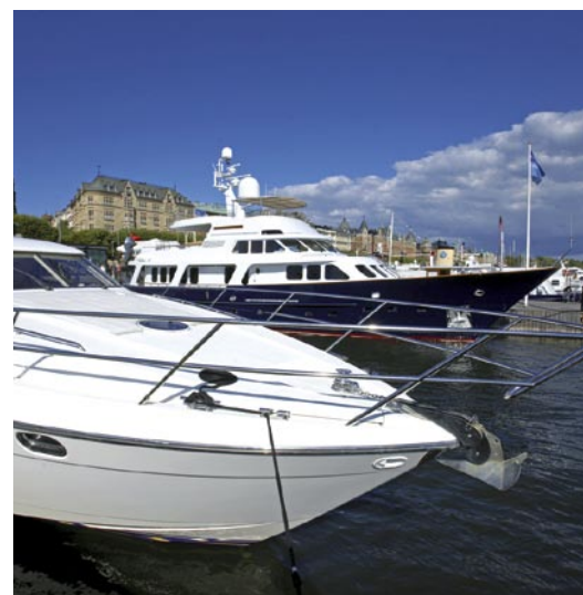
1. Strandvägen 2. Nybrokajen 3. Skeppsbron 4. Stadsgården